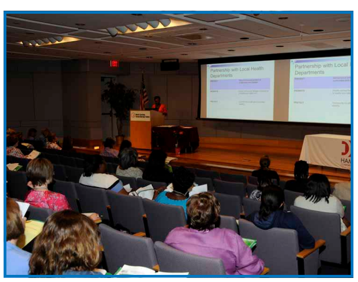
A Captive Audience at the Summit.