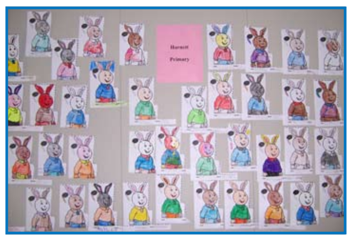
Buster's All Star Artwork, Harnett County Health Department

Recently, some local asthma coalitions have incorporated art into their asthma education and outreach! This has been a unique way to increase awareness in children with asthma and their classmates and friends of the importance of asthma control.