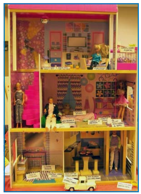
Trigger House Exhibit, Wake County Asthma Fair